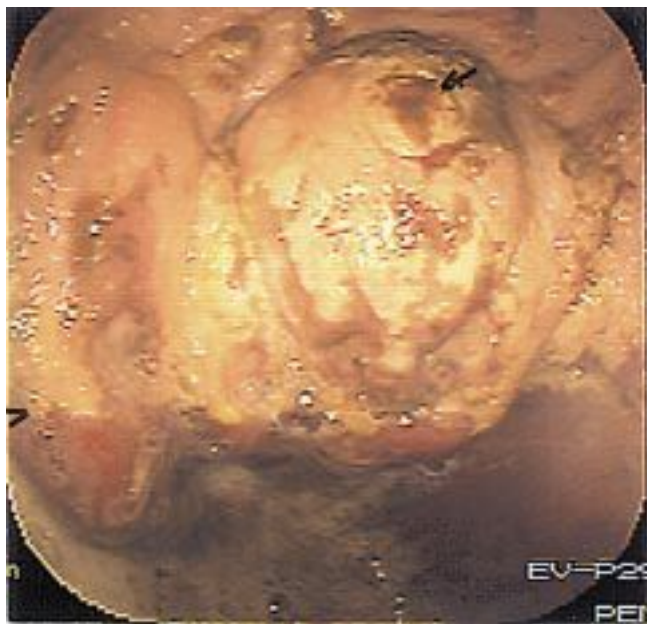
Figure 1. Image from a videoendoscopic examination of a horse's stomach showing grade III lesions (arrow) in the squamous mucosa above the margo plicatus (arrow head) on the greater curvature.